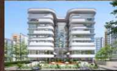
UNITY ONE Indore