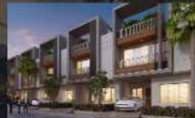
KRISHNA ENCLAVE Bhopal