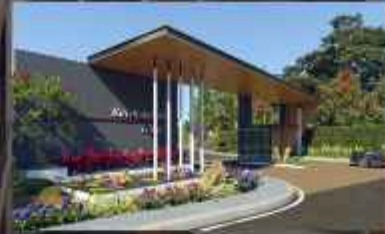
RAICHANDANI & FUTNANI VILLAS Hyderabad