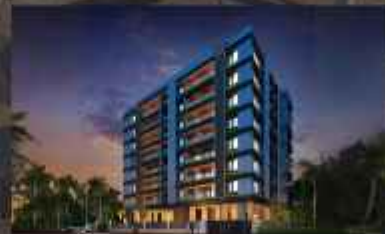
THE SHWET Pune