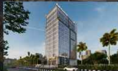
RAICHANDANI GATEWAY Pune