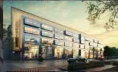
RAICHANDANI MALL Hyderabad