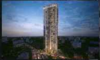
EKA ONE Hyderabad