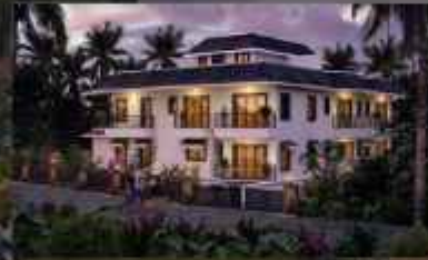
LA MARVEL Dona Paula