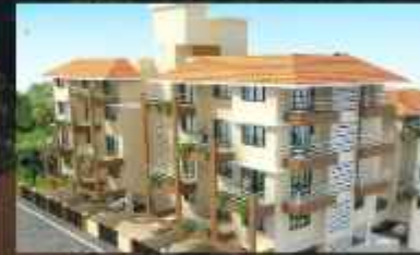
CASA SOLITAIRE Dona Paula