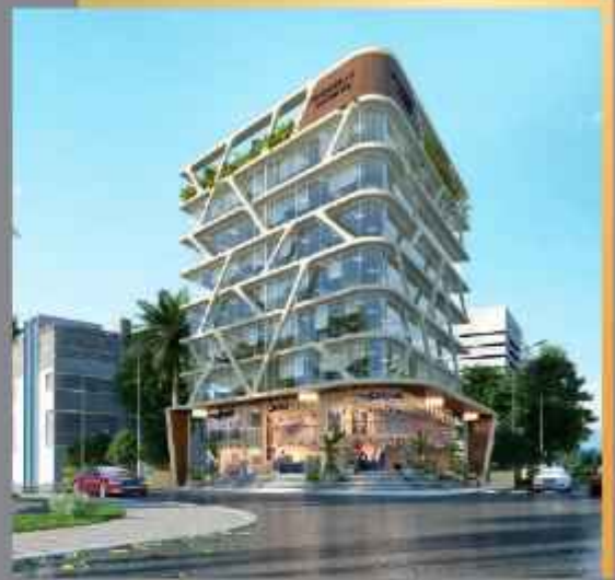
ALPHA-C PAN CARD ROAD