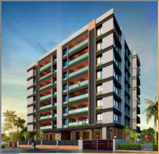
THE SHWET BANER