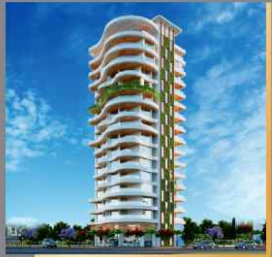
SUNMAN MODEL COLONY