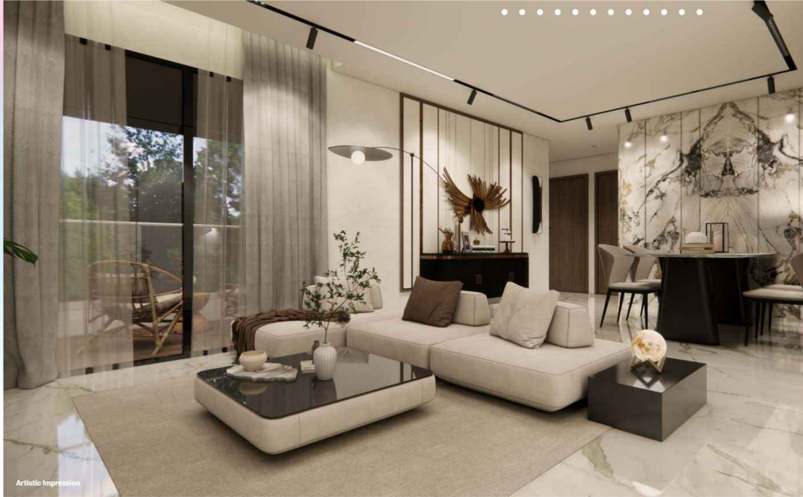
Living Area • • •