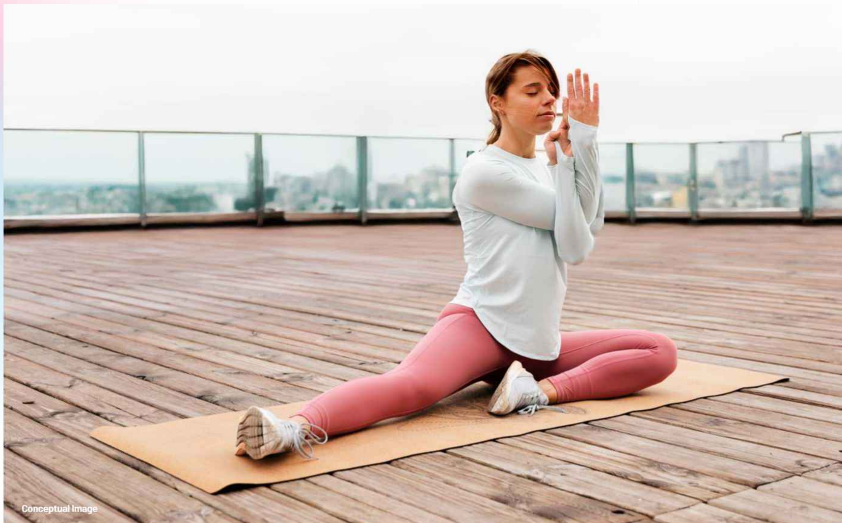
Yoga Deck ● ● ●