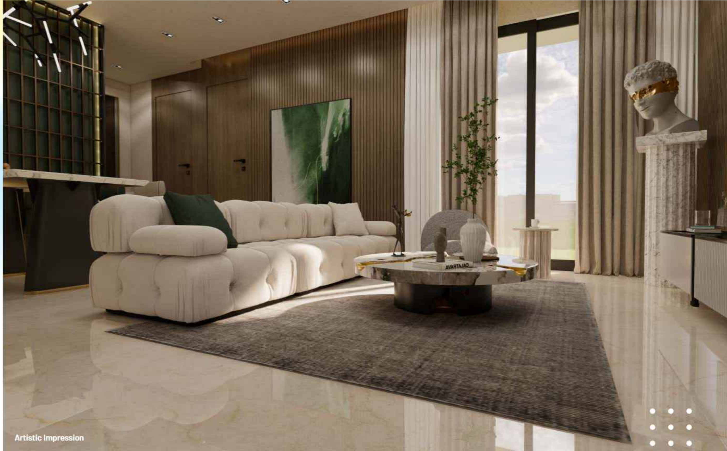
Living Area ● ● ●