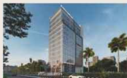
RAICHANDANI GATEWAY Pune