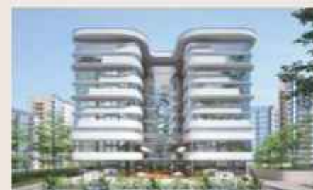
UNITY ONE Indore