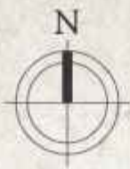
Ground Floor Plan- Villa C