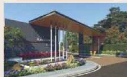
RAICHANDANI & FUTNANI VILLAS Hyderabad