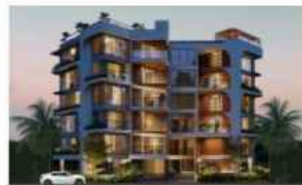
BOHO BLISS Calangute, Goa