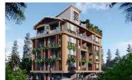
ELEMENTS Arpora, Goa