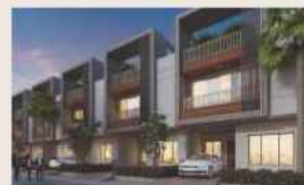
KRISHNA ENCLAVE Bhopal