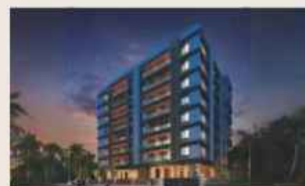
THE SHWET Pune