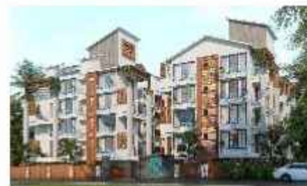
HARBOUR HEIGHTS Calangute, Goa