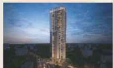
EKA ONE Hyderabad