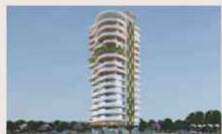
SUNMAN APARTMENTS Pune