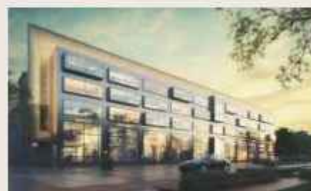
RAICHANDANI MALL Hyderabad